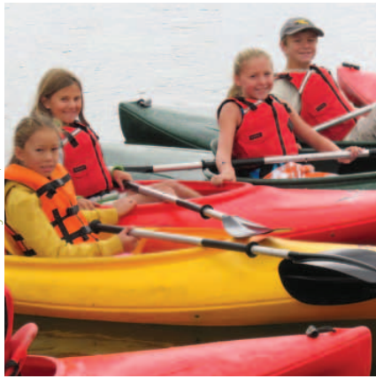
Montana Natural History Center, Missoula

Helena Indian Alliance Helena Industries, Inc Helena Symphony Society HELP Committee & Boys & Girls Club of the Hi-Line Heritage Christian School Hi-Line Home Programs Hi-Line Women Against Breast Cancer Historic St. Mary's Mission Hockaday Museum of Art Holter Museum of Art Homewood Inc Hopa Mountain, Inc