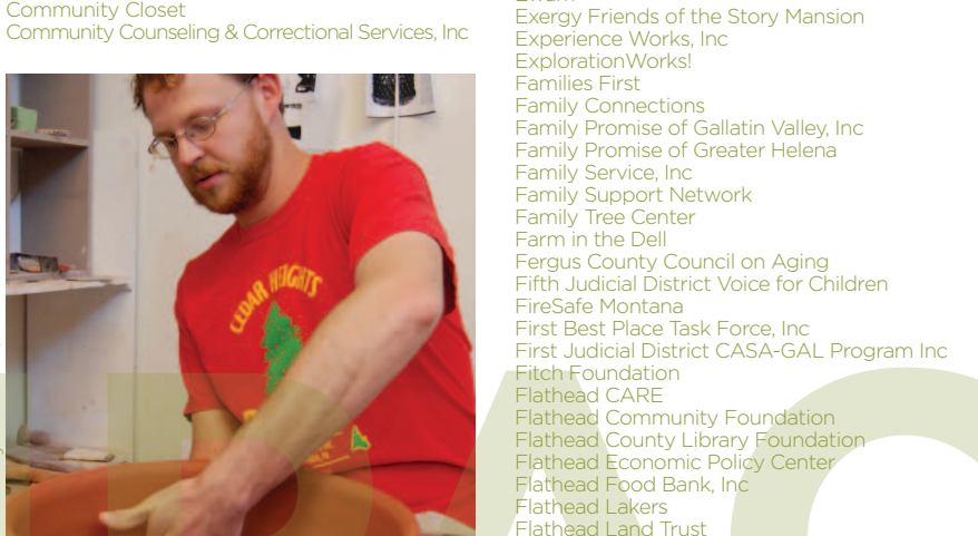
Archie Bray Foundation, Helena