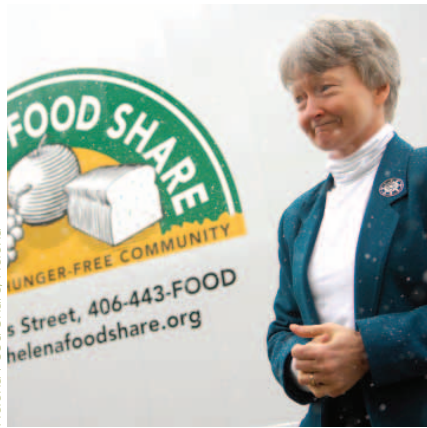
Helena Food Share, Helena

Montana Supporting Soldiers Montana Tech Foundation Montana TheatreWorks Montana Veterans Foundation Montana Weed Control Association Montana Wilderness Association Montana Youth Soccer Association Montana's Parrot & Exotic Bird Sanctuary Mountain View Social Development Center MSU Billings Foundation MusEco Media & Education Project Museum of the Rockies, Inc Musikanten Montana Musselshell Valley Community Foundation Myrna Loy Center for Performing & Media Arts NAMI—Billings NARAL Pro-Choice Montana Foundation National Alliance on Mental Illness of Montana National American Indian, Alaskan & Hawaiian Educational Development Center National Center for Appropriate Technology—N.C.A.T. National Coalition Building Institute National Indigenous Women's Resource Center, Inc National Institute on Money in State Politics National Museum of Forest Science-History, Inc National Parks Conservation Association Native American Community Development Corporation NC Foundation Neighbor To Neighbor NeighborWorks Nerdy Girls, Inc Nkwusm North Central Area Agency on Aging North Central Independent Living Services North Valley Food Bank North Valley Hospital Foundation Northern Plains Resource Council Northern Rockies Educational Services Northern Rocky Mountain RC&D Northwest Connections—Environmental & Cultural Resource Center Northwest Montana United Way Inc Nourish The Flathead NW Montana Headstart NW Montana Veterans Stand Down Nye Community Foundation