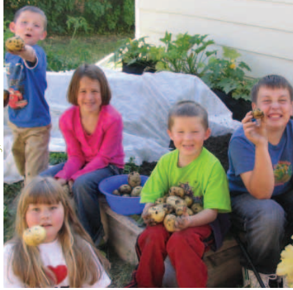
Greater Gallatin United Way, Bozeman

Montana Supporting Soldiers Montana Tech Foundation Montana TheatreWorks Montana Veterans Foundation Montana Weed Control Association Montana Wilderness Association Montana Youth Soccer Association Montana's Parrot & Exotic Bird Sanctuary Mountain View Social Development Center MSU Billings Foundation MusEco Media & Education Project Museum of the Rockies, Inc Musikanten Montana Musselshell Valley Community Foundation Myrna Loy Center for Performing & Media Arts NAMI—Billings NARAL Pro-Choice Montana Foundation National Alliance on Mental Illness of Montana National American Indian, Alaskan & Hawaiian Educational Development Center National Center for Appropriate Technology—N.C.A.T. National Coalition Building Institute National Indigenous Women's Resource Center, Inc National Institute on Money in State Politics National Museum of Forest Science-History, Inc National Parks Conservation Association Native American Community Development Corporation NC Foundation Neighbor To Neighbor NeighborWorks Nerdy Girls, Inc Nkwusm North Central Area Agency on Aging North Central Independent Living Services North Valley Food Bank North Valley Hospital Foundation Northern Plains Resource Council Northern Rockies Educational Services Northern Rocky Mountain RC&D Northwest Connections—Environmental & Cultural Resource Center Northwest Montana United Way Inc Nourish The Flathead NW Montana Headstart NW Montana Veterans Stand Down Nye Community Foundation