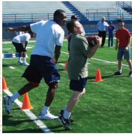
Big Brothers Big Sisters, Bozeman

Florence Crittenton Home & Services Footloose Montana Forward MT Foundation Foundation for Community Care Foundation for Community Vitality Friends of Dornix Park Friends of the Hobson Library Friends of the Library (Livingston) Friends of the Museum of the Plains Indian Friends of the Whitehall Community Library Friendship Center of Helena, Inc Friendship House Front Range CASA/GAL Gallatin County Love in the Name of Christ Gallatin Gateway Youth Group Gallatin Ice Foundation Gallatin Valley Farm to School Gallatin Valley Land Trust Gallatin Valley YMCA Garden City Harvest Gateway to Glacier Trail Girl Scouts of Montana & Wyoming Glacier Community Health Center, Inc Glacier County Historical Museum Glacier National Park Fund Glacier Natural History Association Glacier Symphony & Chorale Glacier Unitarian Universalist Fellowship Glen-Wood, Inc Glendive Medical Center Foundation Global Village, Inc Global Wildlife Resources, Inc Grandstreet Theatre Great Beginnings Montessori School Great Burn Study Group Great Falls Area Community Foundation Great Falls Community Food Bank Great Falls Development Authority, Inc Great Falls Senior Citizen's Center Great Falls Symphony Association Great Falls Young Peoples Choir Greater Gallatin United Way Greater Gallatin Watershed Council Greater Glendive Community Foundation