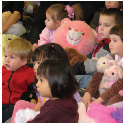
Flathead County Library Foundation, Kalispell

Florence Crittenton Home & Services Footloose Montana Forward MT Foundation Foundation for Community Care Foundation for Community Vitality Friends of Dornix Park Friends of the Hobson Library Friends of the Library (Livingston) Friends of the Museum of the Plains Indian Friends of the Whitehall Community Library Friendship Center of Helena, Inc Friendship House Front Range CASA/GAL Gallatin County Love in the Name of Christ Gallatin Gateway Youth Group Gallatin Ice Foundation Gallatin Valley Farm to School Gallatin Valley Land Trust Gallatin Valley YMCA Garden City Harvest Gateway to Glacier Trail Girl Scouts of Montana & Wyoming Glacier Community Health Center, Inc Glacier County Historical Museum Glacier National Park Fund Glacier Natural History Association Glacier Symphony & Chorale Glacier Unitarian Universalist Fellowship Glen-Wood, Inc Glendive Medical Center Foundation Global Village, Inc Global Wildlife Resources, Inc Grandstreet Theatre Great Beginnings Montessori School Great Burn Study Group Great Falls Area Community Foundation Great Falls Community Food Bank Great Falls Development Authority, Inc Great Falls Senior Citizen's Center Great Falls Symphony Association Great Falls Young Peoples Choir Greater Gallatin United Way Greater Gallatin Watershed Council Greater Glendive Community Foundation