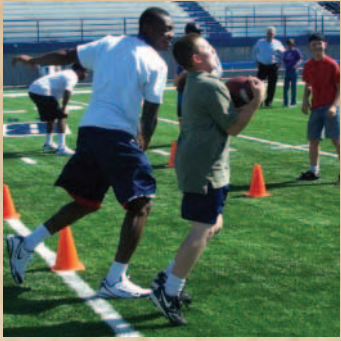
Big Brothers Big Sisters of Gallatin Co., Bozeman

Region IV Family Outreach Residential Support Services Resource, Support & Development Richland Opportunities Rim Country Land Institute Rimrock Opera Company RiverStone Health Foundation Roberts Community Foundation Rocky Mountain Development Council Rocky Mountain Elk Foundation Rocky Mountain Front Community Foundation Rolling Dog Ranch Animal Sanctuary Ronald McDonald House Charities of Montana Ruby Habitat Foundation Ruby Valley Hospital Foundation Rural Dynamics Rural Employment Opportunities Rural Landscape Institute S.A.V.E.—Student Advocates for Valuing the Environment Sanders County Coalition For Families Sanders County Community Development Corporation Santa Saks Second Chance Homes Seeley Swan Medical Center Sheridan Health Care Foundation SightLife Sixth Judicial District CASA GAL Snowy Mountain Development Corporation Southwestern Montana Family YMCA Special K. Ranch Special Olympics Montana Spina Bifida Association of Montana Support Group Spring Meadow Resources St. Luke Community Healthcare Foundation St. Patrick Hospital & Health Foundation St. Vincent DePaul Society St. Peters Hospital Foundation Stafford Animal Shelter STEPS—Support & Techniques for Empowering People Stevensville Community Foundation Stillwater Historical Society & Museum of the Beartooths Student Assistance Foundation Sun River Watershed Sunburst Unlimited Susan G. Komen for the Cure, Montana Affiliate Sustainable Business Council Sustainable Obtainable Solutions Swan Ecosystem Center