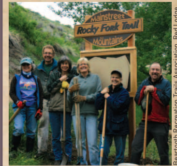
Beartooth Recreation Trails Association, Red Lodge

Farm in the Dell Farms for Families Fergus County Council on Aging Fifth Judicial District Voice for Children FireSafe Montana First Judicial District CASA-GAL Program Fitch Foundation Flathead CARE Flathead Community Foundation Flathead County Library Foundation Flathead Food Bank Flathead Land Trust Flathead Reservation & Lake County Coalition for Kids Flathead Valley Montessori School Florence Crittenton Home & Services Footloose Montana Foundation for Community Care Foundation for Community Vitality Friends of Irish Studies in the West Friends of the Hobson Library Friends of the Library (Livingston) Friends of the Museum of the Plains Indian Friends of the Shelter Friends to Youth Friendship Center of Helena Friendship House Fun2U Gallatin County Love in the Name of Christ Gallatin Gateway Youth Group Gallatin Valley Land Trust Garden City Harvest Girl Scouts of Montana & Wyoming Glacier Community Health Center Glacier County Historical Museum Glacier National Park Foundation Glacier Natural History Association Glacier Symphony & Chorale Glen-Wood Global Village Grandstreet Theatre Great Burn Study Group Great Falls Community Food Bank Great Falls Development Authority Great Falls Native Art Association Great Falls Senior Citizen's Center Great Falls Symphony Association