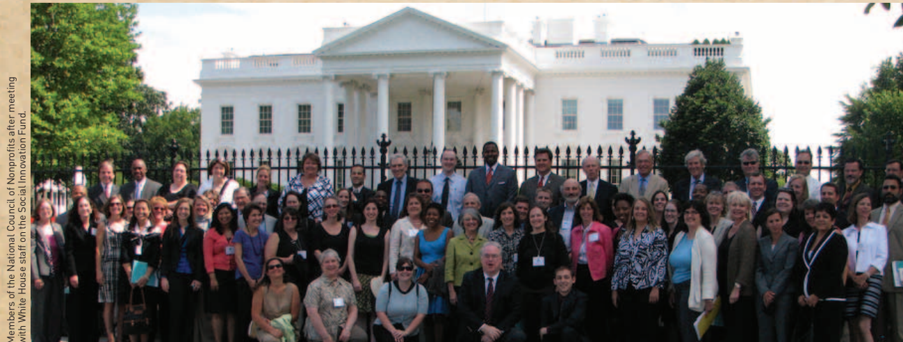
Members of the National Council of Nonprofits after meeting with White House staff on the Social Innovation Fund.