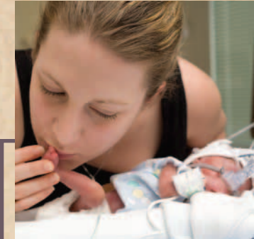
March of Dimes, Billings