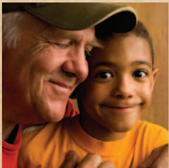
Montana Youth Homes, Missoula