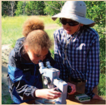
Exploration Works, Helena—Microscope Field Study

A Carousel for Missoula Foundation A.W.A.R.E. Absarokee Community Foundation ACLU of Montana Foundation Adventure Cycling Association AERO—Alternative Energy Resources Organization Alberta Bair Theater Alliance for Youth Alternatives American Prairie Foundation American Red Cross of Montana Anaconda Local Development Corporation Anaconda PCA Family Resource Center Archie Bray Foundation Area II Agency on Aging