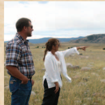
Montana Weed Control Association, Twin Bridges

Montana Audubon Montana Center for International Visitors Montana Chamber Foundation Montana Child Care Resource & Referral Network Montana Children's Initiative Montana Coalition Against Domestic & Sexual Violence Montana Community Development Corporation Montana Community Finance Corporation Montana Community Foundation Montana Conservation Corps Montana Council of Teacher of Mathematics Montana Council on Developmental Disabilities Montana Council of Economic Education Montana Council on Problem Gambling Montana Creativity Quest— Montana Destination Imagination Montana Credit Unions for Community Development Montana Economic Developers Association Montana Economic Revitalization & Development Institute Montana Environmental Education Association Montana FFA Foundation Montana Fish Wildlife & Parks Foundation Montana Food Bank Network Montana History Foundation